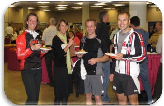
Duluth Conference Fun Run/Walk